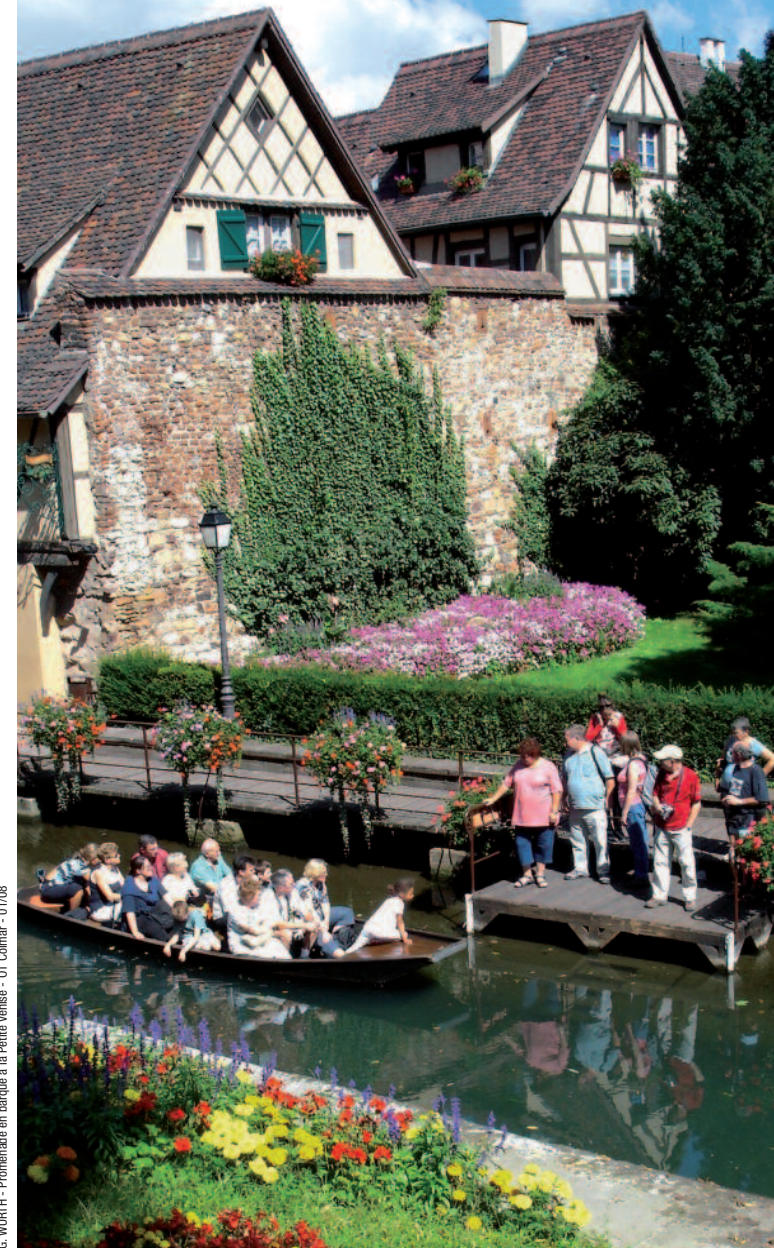
Crédit photos : G. WÜRTH - Promenade en barque à la Petite Venise - OT Colmar - 01/08